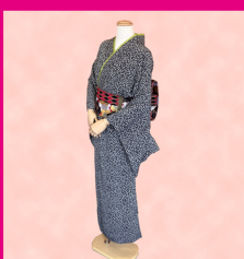
*Produce image of kimono